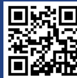
Mad Hatters Pottery Painting Café