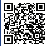
The Mad Hatters Club